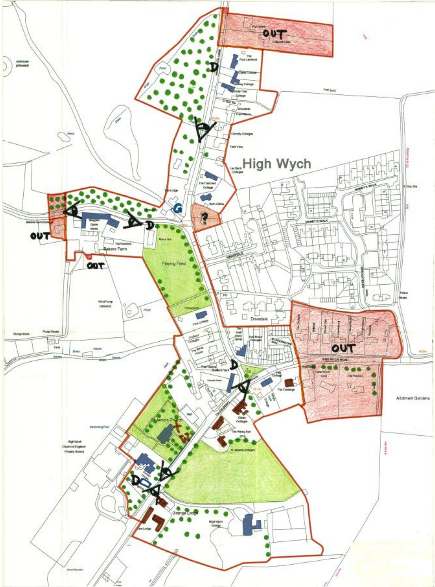
High Wych Conservation Area Appraisal. Plan 2 - Character Analysis.