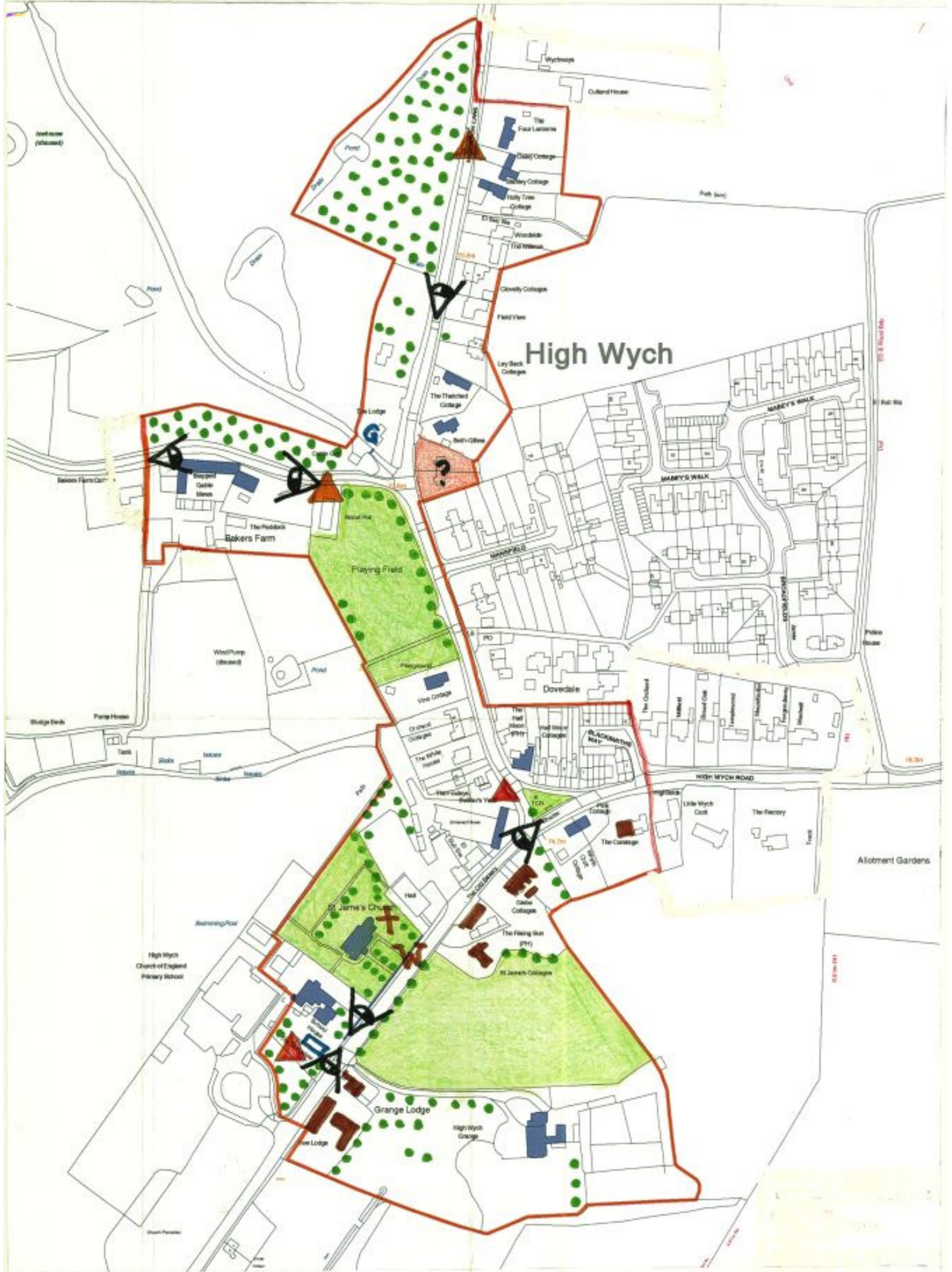
High Wych Conservation Area Appraisal. Plan 3 - Management Plan.